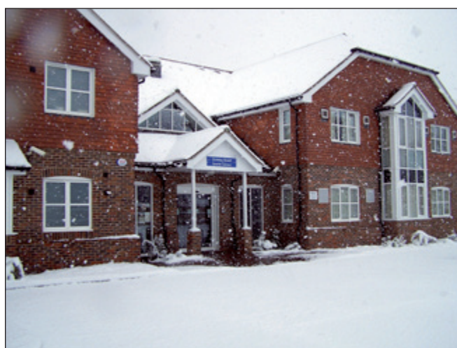
Snow at Crawley Down Health Centre.