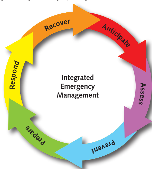
Figure 1 Integrated emergency management