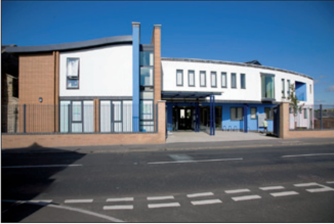
Sacriston Medical Centre, Sacriston, County Durham

4.20 The building of primary care premises to meet the requirements of a sustainable building with low environmental impact is well understood, but the fact that there are additional benefits to resilience has been less explored. This was explored with the help of Sacriston Surgery, County Durham, who have recently completed a sustainable build.