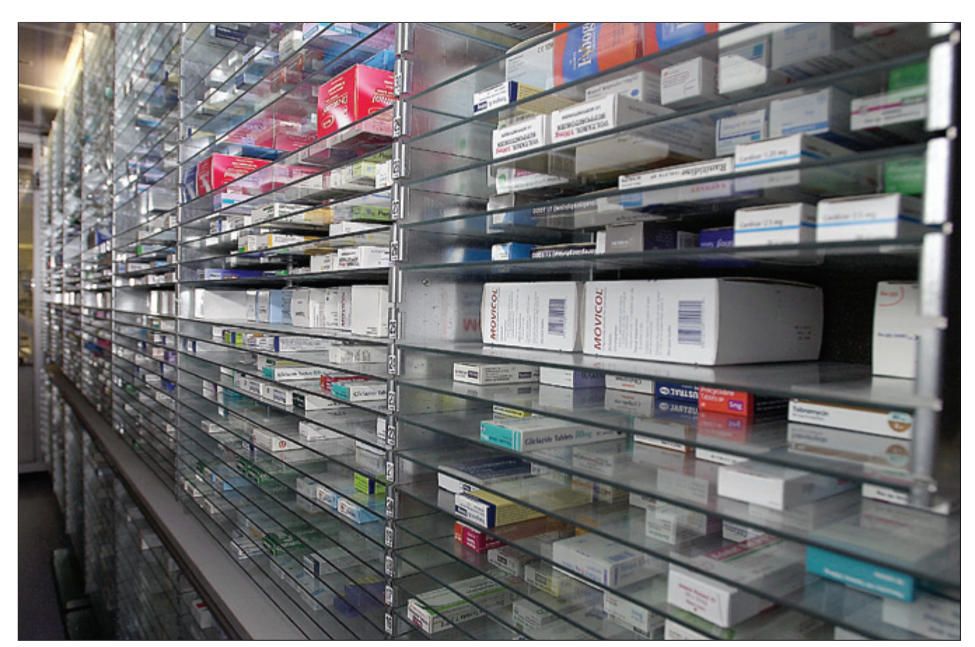
Medicines storage for use with dispensing robot