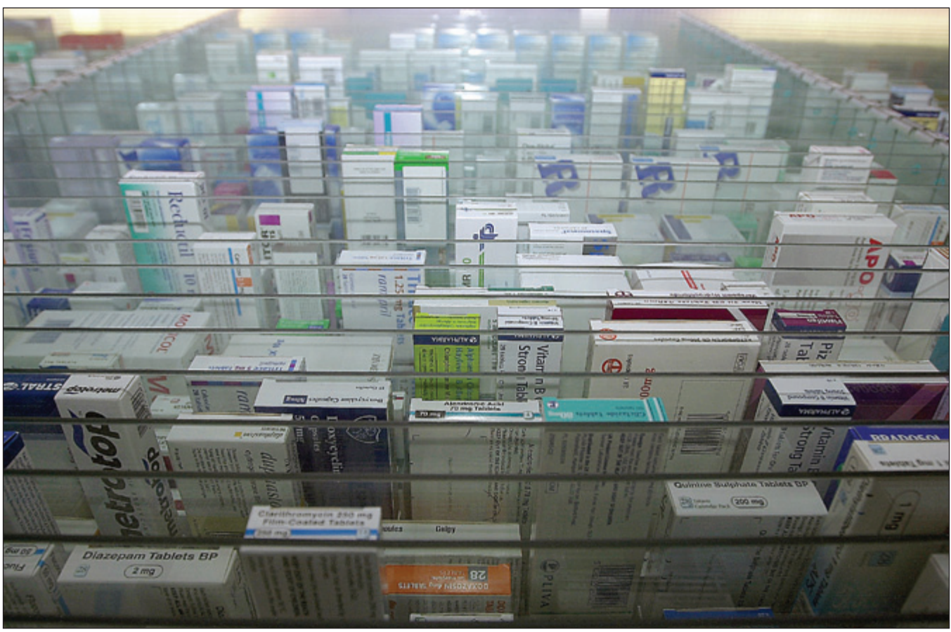
Medicines storage for use with dispensing robot