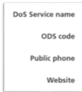
Figure 1: Example of the information the DoS Profile Updater asks you to review

On the day of declaration, contractors will be required to confirm that the information in the pharmacy's NHS 111 DoS profile is correct on the DoS Profile Updater. This must have been completed between 00:00 on 1 October 2019 and 23:59 on 30 November 2019 to meet the quality criterion.