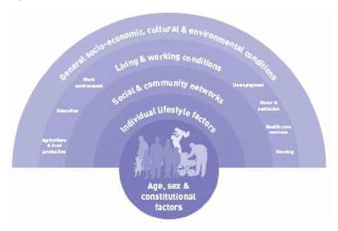
Figure 1: Determinants of Health<sup>2</sup>

• Identifying the effective and cost effective interventions that could be implemented to address the issues of concern.