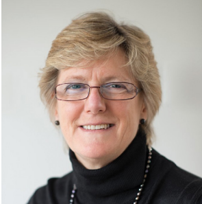
Professor Dame Sally C Davies Chief Medical Officer Chief Scientific Adviser Department of Health & Social Care

Although many of us enjoy the sunshine, as a result of climate change we are increasingly likely to experience extreme summer temperatures that may be harmful to health. For example the temperatures reached in 2003 are likely to be a ‘normal’ summer by 2040, and indeed globally, countries have already experienced record temperatures. We do not know whether or not there will be severe heat over the course of this summer, but we do want to make sure that everyone takes simple precautions to stay healthy during periods of hot weather and when in the sun.