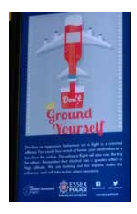
Figure 1: Alcohol awareness poster at Stansted Airport

Other airports are carrying out information campaigns to inform passengers about the consequences of excessive alcohol consumption in air travel, such as the poster in Stansted Airport depicted in figure 1.