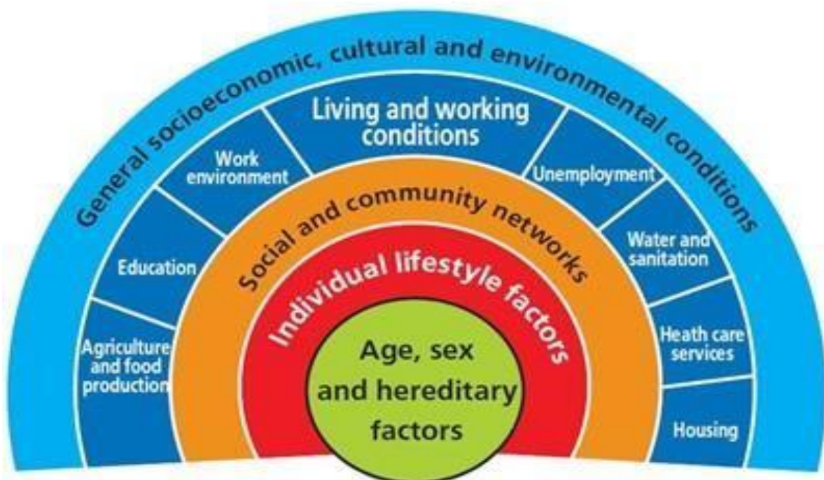
The Determinants of Health (1992) Dahlgren and Whitehead

4.1 Health inequalities are systematic, avoidable and unjust differences in health and wellbeing between different groups of people viii . These differences arise from the wider social determinants of health as illustrated in Dahlgren and Whitehead's model depicting the wider determinants of health.