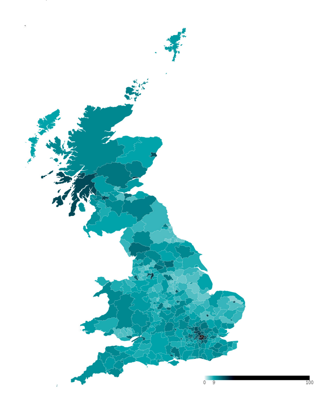
Figure 2: Percentage of households by Local Authority District without access to private green space – Interactive map available here