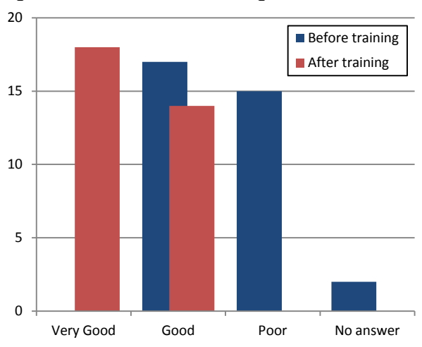
Figure 1: Self-rated knowledge before and after training*

saying they now felt very confident and 10 confident. However, two still did not feel confident despite the training (figure 2).