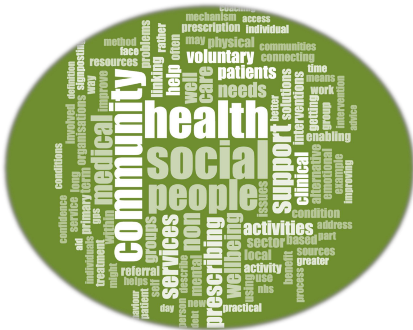
Figure 3. A WordCloud analysis of descriptions of social prescribing.

The 'word cloud' analysis of survey data in Figure 3 supports the view of respondents that people, communities and addressing social issues are central to social prescribing for health-related issues: